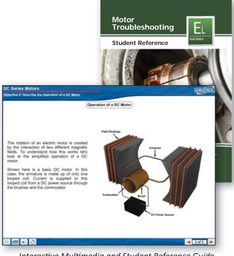
Interactive Multimedia and Student Reference Guide