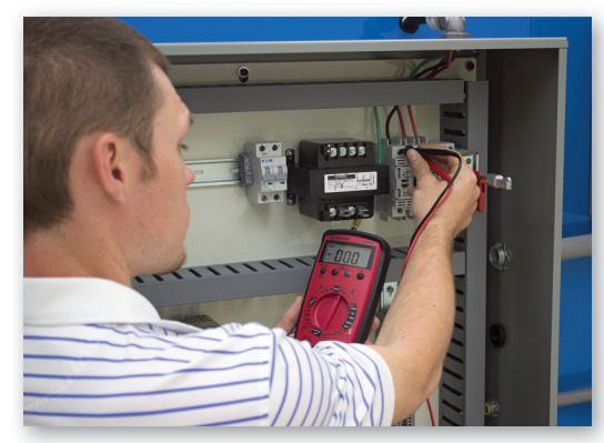
Voltage Check Using Multimeter

push-to-test buttons; and much more all on a mobile workstation! These industrial components can be used to practice an array of hands-on skills like installing a terminal block in an electrical panel; splice motor leads using ring lug connectors; bundle wires in an electrical panel; manually operate an electro-pneumatic valve; and select circuit protection for an application. These real-world components will allow learners to gain confidence and competence in working with equipment they'll actually see on the job.