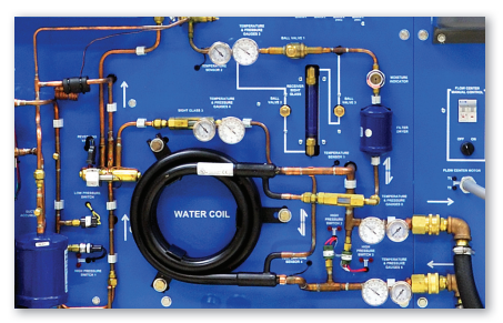
Real-World Geothermal System Components

sor, 2-ton heat pump, ground source loop, variable speed ECM air blower, water coil heat exchanger, electrical test points, and high-density polyethylene pipe. These components are mounted for easy observation on a vertical panel, allowing learners to evaluate system operation and performance.