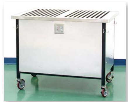
950-WT1 Magnetic, Removable Stainless Steel Top Workstation

The built-in down-draft system contains filters designed to capture the welding smoke. The turnkey storage station provides lockable, mobile storage for tools/fixtures, gas cylinder, and safety gear needed. The GMAW welder provides an industrial quality experience while being very portable, and comes with a wide assortment of safety gear.