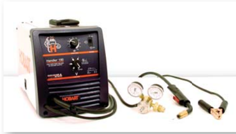
950-WT1 Portable GMAW Welder

Amatrol supplies these industrial-grade, top-flight components in order to give the learner the opportunity to work with real-world mechanisms and gain experience they would normally only acquire on the job.