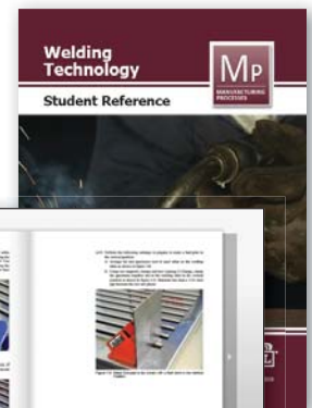
Optional Online eBook and Student Reference Guide