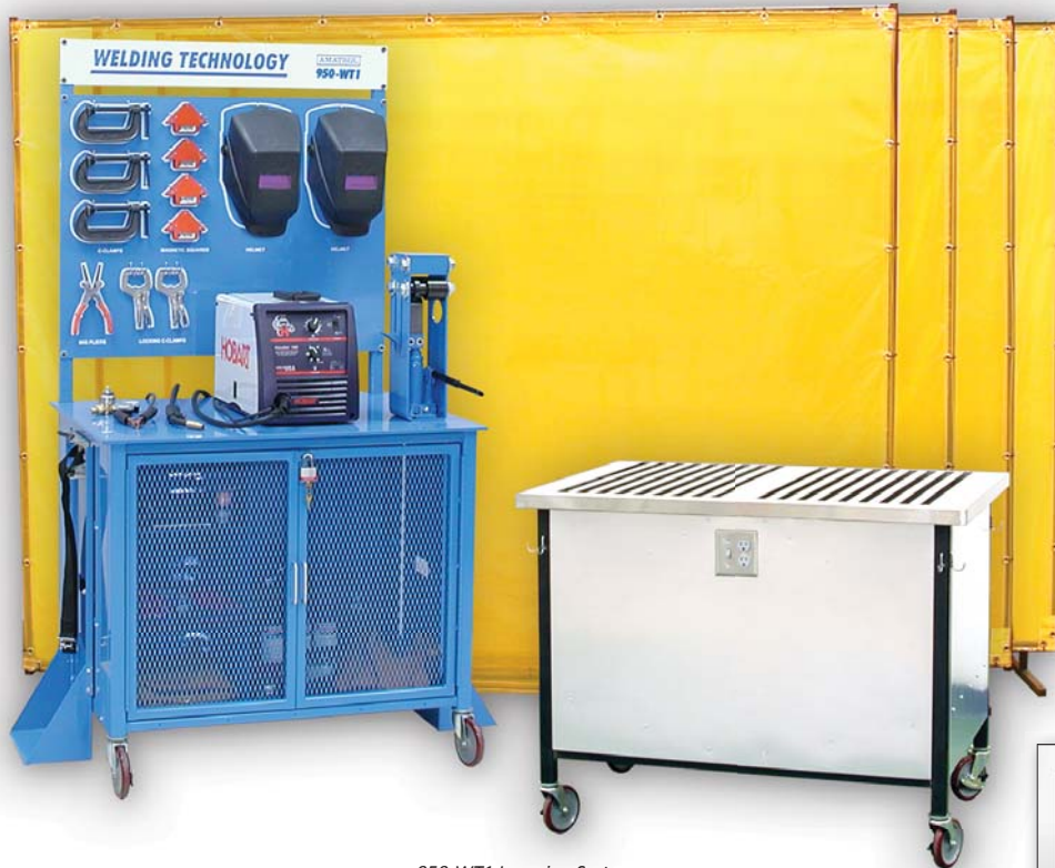
950-WT1 Learning System