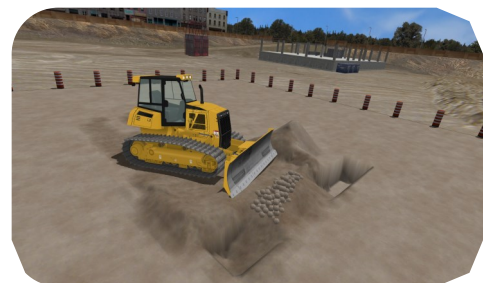
Using the blade to backfill a trench