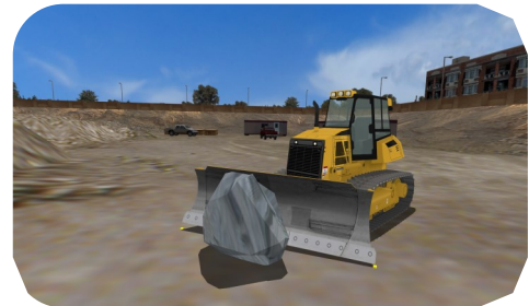
Using the blade to control the path of a boulder