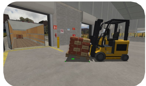
Placing loads into a box truck at the loading dock