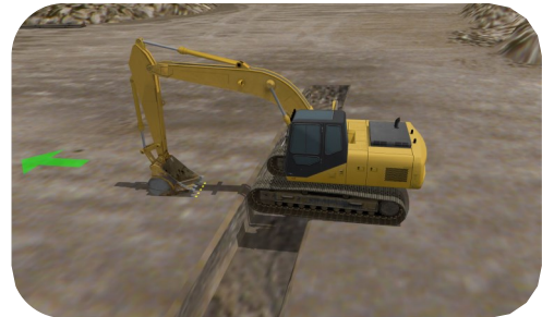
Trench Crossing using Boom Jacking