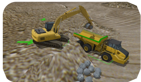
Truck spotting with an interactive, articulated dump truck