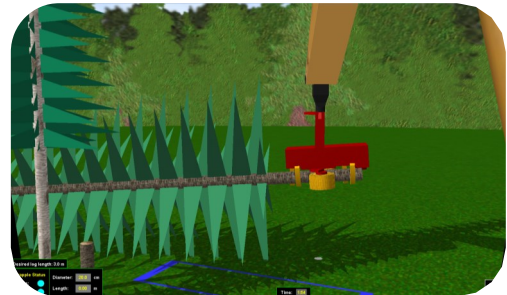
Mastering the basics of the complete Cut-To-Length cycle