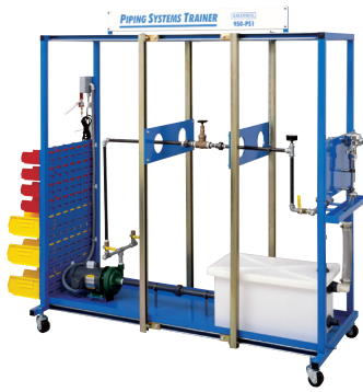
Piping Learning System (950-PS1)