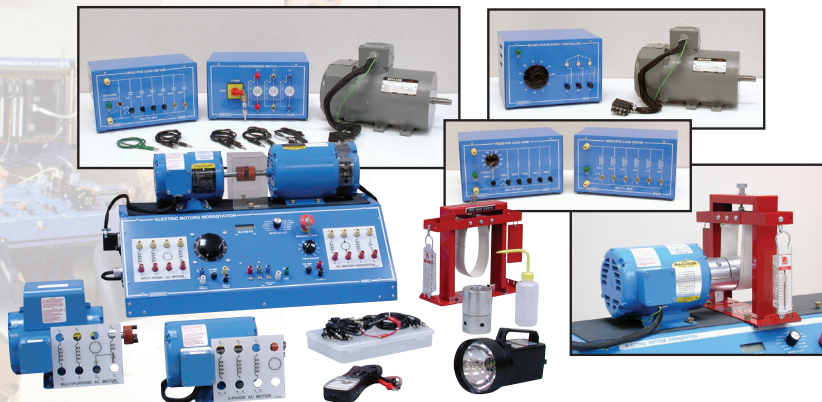
Electrical Machines Learning System with DC Generators, Alternator/Synchronous Motors and Wound Motors (85-MT2, B-D)