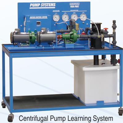
Centrifugal Pump Learning System (950-PM1 plus options)