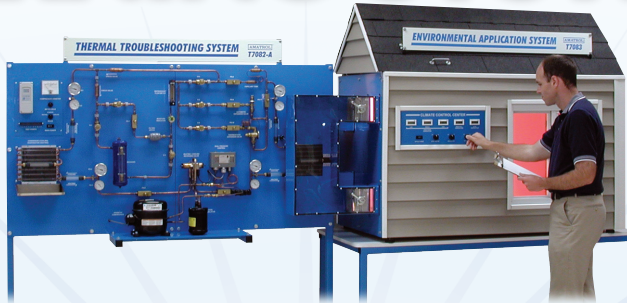
Air Conditioning / Heat Pump Troubleshooting Learning System Connected to the Environmental Applications Learning System