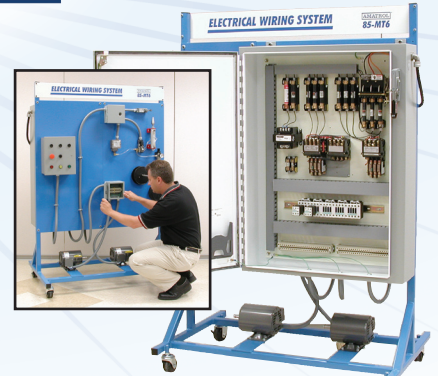
Industrial Electrical Wiring Learning System (85-MT6)

HVAC Industry Learning Systems Continued On Back →