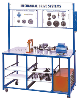
Mechanical Drives 1 Learning System (950-ME1-SB) with Vibration Analysis