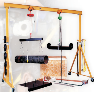
Rigging Learning System (950-RG1)