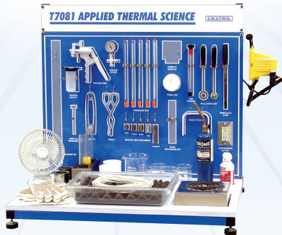
Thermal Science Learning System (T7081)