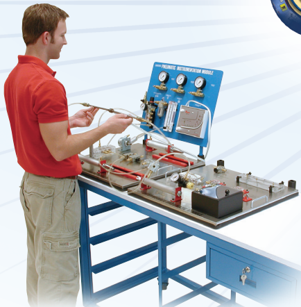
Basic Pneumatics Learning System with Intermediate and Advanced Options (850-P1 plus options)