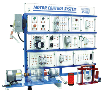
Electrical Motor Control Learning System with Motor Braking and Electronic Counter Options