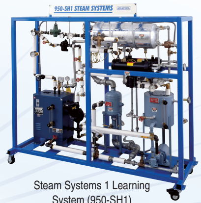
Steam Systems 1 Learning System (950-SH1)