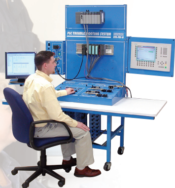
PLC Learning Systems (Allen-Bradley, Siemens) that can include Amatrol's Unique Automatic Fault Insertion