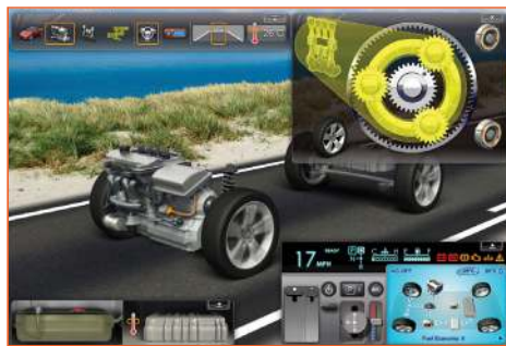
HYBRID VEHICLE SIMULATOR

This module includes high-quality curriculum materials and a sophisticated virtual hybrid vehicle simulator. The curriculum materials are divided into on-screen theory presentations, investigations, and assessment tests. The dynamic simulator software can be used to control the panel trainer or it can be used independently, illustrating the function of each component during the different phases of power application and recharging.