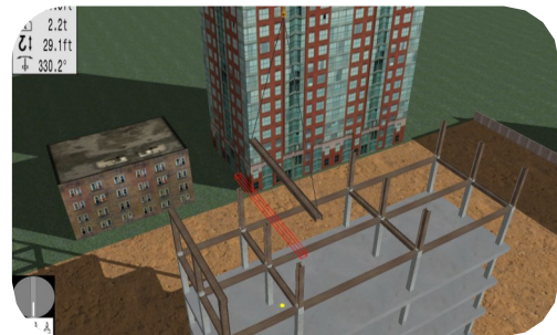
Positioning girders at target positions as part of steel erection