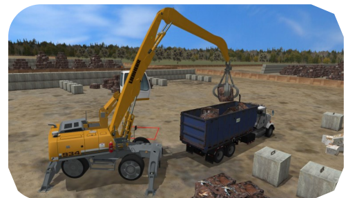
Loading a truck-mounted container