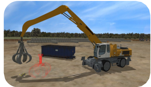
Positioning the grapple into the target